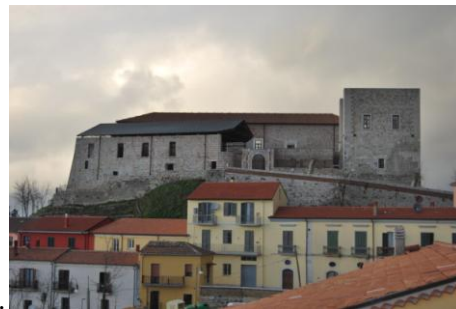
Figure 8: S. Angelo dei Lombardi.

Following the examination, with a comparative approach, of methods adopted in the reconstruction of individual cities after earthquakes in recent years, we can outline several degrees of conservation and reconstruction: the reconstruction of monuments; the reconstruction of the network of public spaces, streets and squares; the reconstruction of the facades of buildings; the reconstruction of urban fabric, consolidating and updating typological and constructive technologies; urban provisional reconstruction in another site; ultimate urban reconstruction in another site; landscape reconstruction in its visible aspects with man-made artifacts. For the reconstruction of Gibellina, following the earthquake of Belice in Sicily (1968), it was decided to rebuild the city elsewhere. In our opinion, this choice has created major problems in the identification of the people with the new place. The art in Gibellina, [figure 9] was used to monumentalize the corpse of the abandoned city.