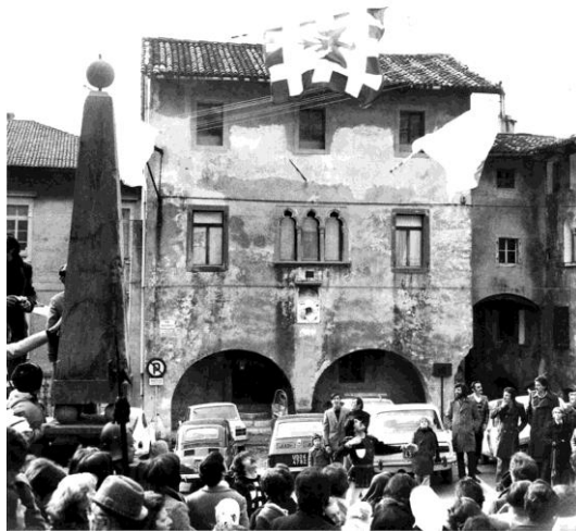
Figure: 3 Venzone before the earthquake