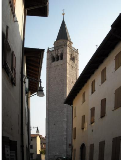
Figure 7: Venzone today: the bell tower (July 2009)