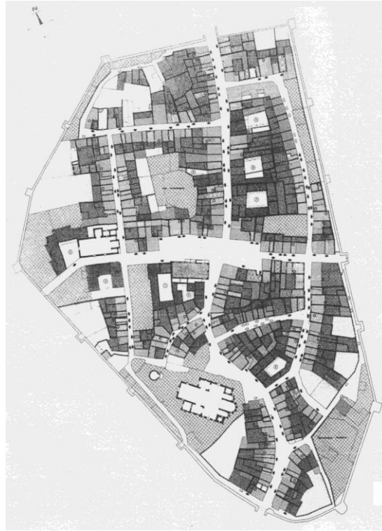
Figure 2: Master plan for the reconstruction of Venzone (Sartogo, 2008)