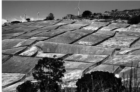
Figure 9: Alberto Burri, Grande cretto , Gibellina (1968).

and stone buildings (Angeletti, 2007). Very interesting is the role played by temporary structures built for emergency housing after the reconstruction (De Cesaris, 2008). In L'Aquila instead is not possible to carry out the comparison: the historical centre has not been rebuilt yet and there isn't a line to follow for its reconstruction. "Temporary housing" was built, a name itself revealing the provisional nature of the solution, but still we don't have an indication on what should be done in the city centre.