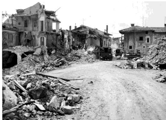
Figure 4: Venzone after the earthquake